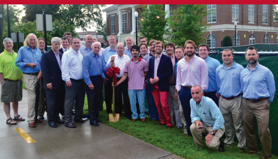
Groundbreaking July 23

PSRST STD U.S. POSTAGE PAID LAWRENCE, KS 66044 PERMIT #570